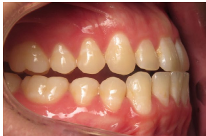
Retracted buccal – Right ( initial )