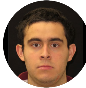
Face at rest ( initial )