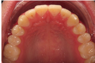
Occlusal – Maxillary ( initial )