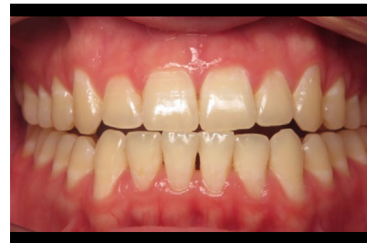
Retracted anterior biting ( initial )