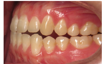
Retracted buccal – Left ( initial )