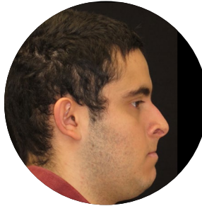
Profile at rest ( initial )