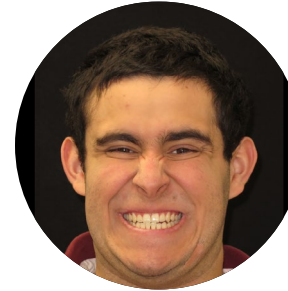
Face smiling ( initial )